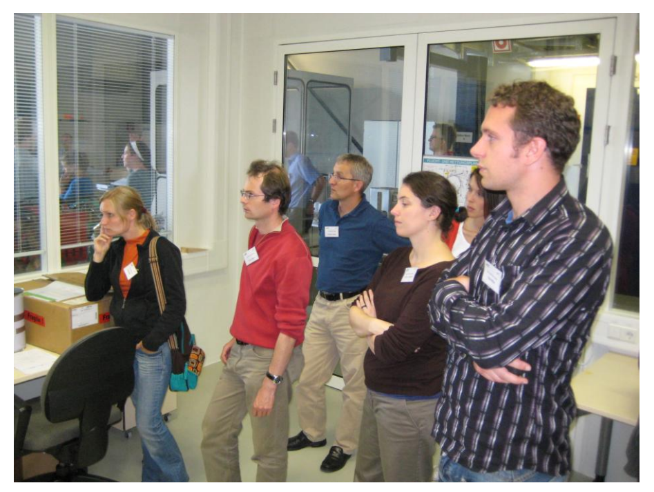
Figure 4: Visit at the SUL-X beamline at Anka Karsruhe