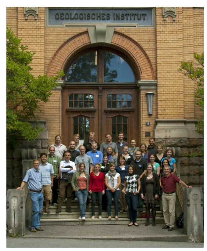
Figure 6: Group picture of all workshop participants, speakers and organizers in front of the geoscience department building at Tuebingen University