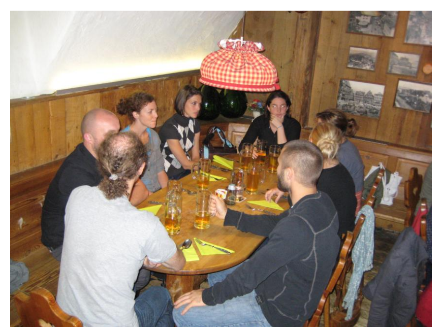
Figure 2: Workshop dinner in the traditional Swabian restaurant "Wurstkueche"