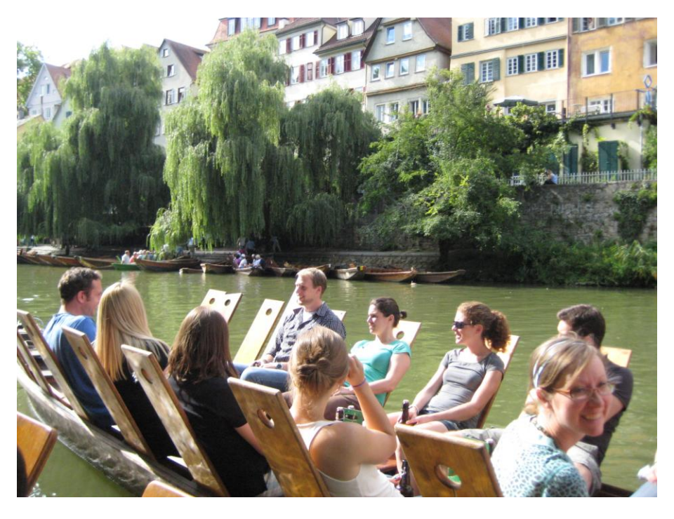
Figure 5: Reviewing the contents of the workshop at the concluding Stocherkahn trip on the river Neckar