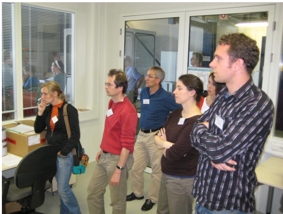
Figure 4: Visit at the SUL-X beamline at Anka Karlsruhe