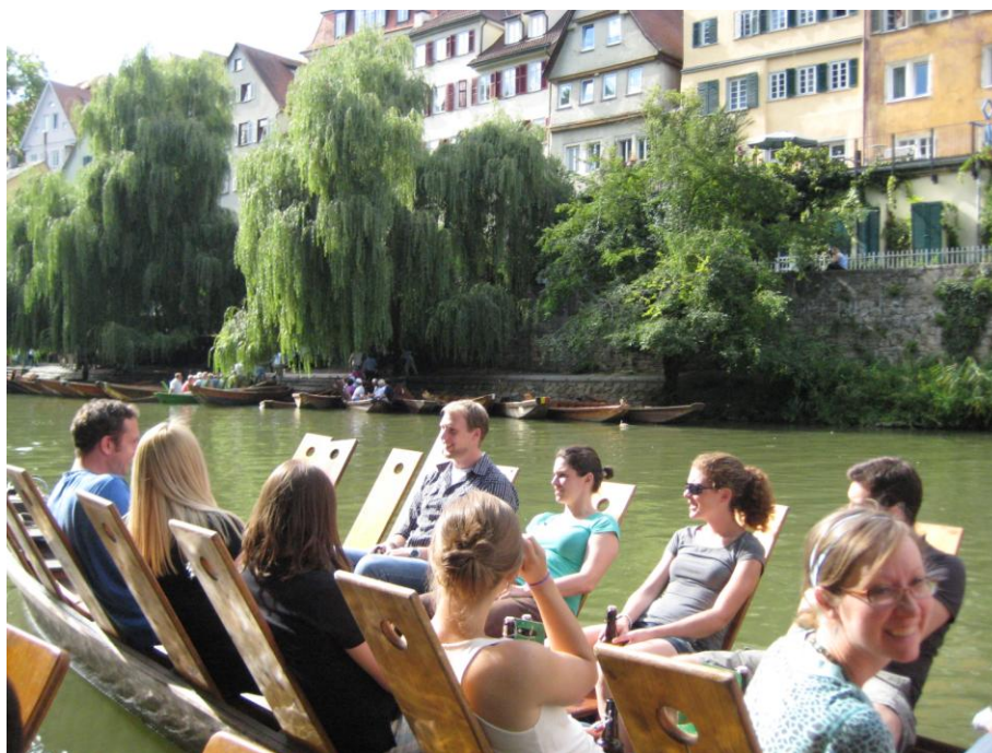
Figure 5: Reviewing the contents of the workshop at the concluding Stocherkahn trip on the river Neckar