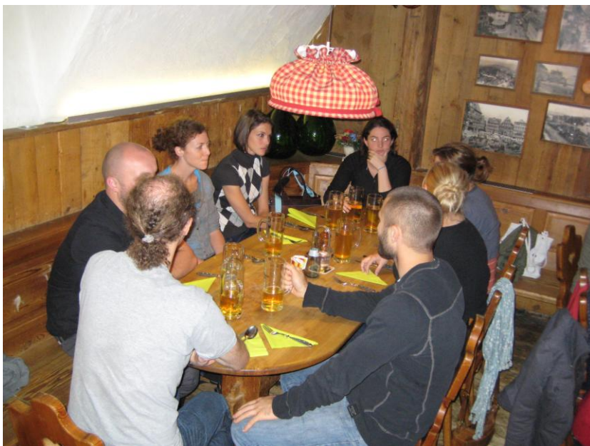
Figure 2: Workshop dinner in the traditional Swabian restaurant “Wurstkueche”