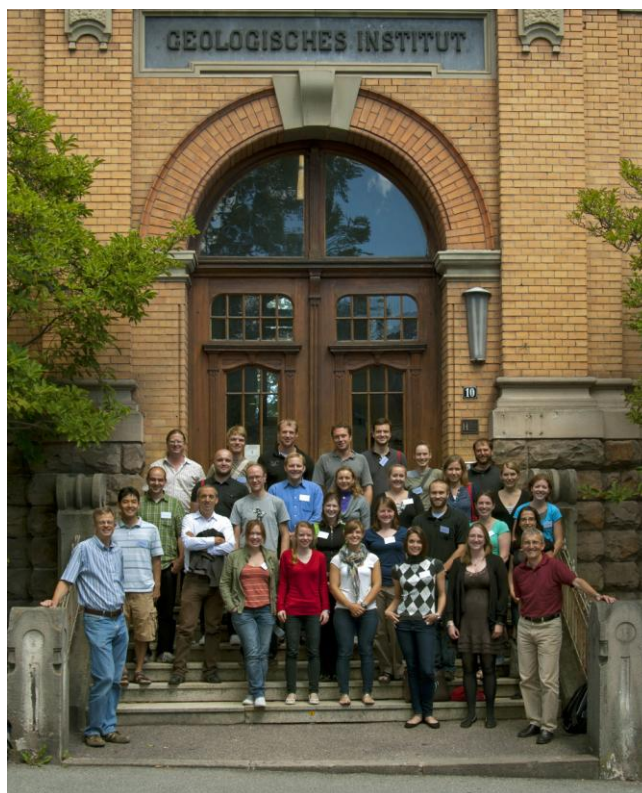
Figure 6: Group picture of all workshop participants, speakers and organizers in front of the geoscience department building at Tuebingen University